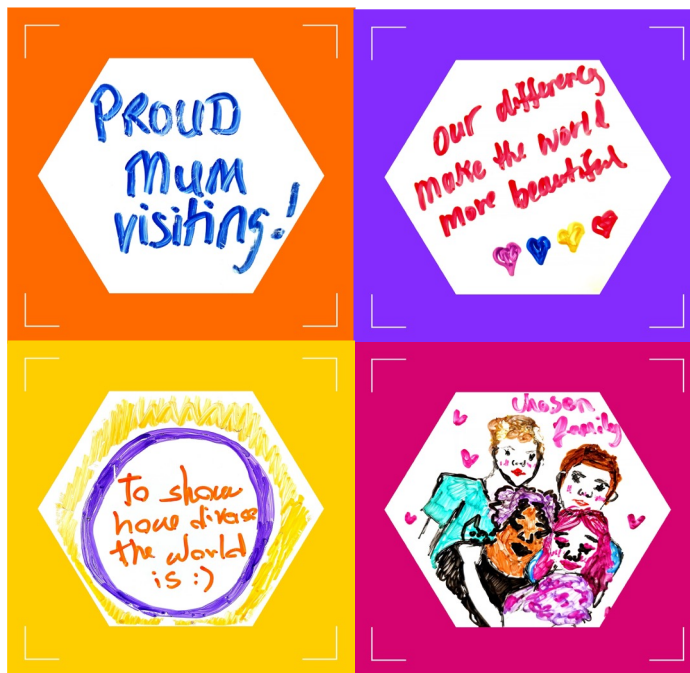
IMAGES VISITOR HEXAGONS ON THE IMPORTANCE OF INCLUSION

We welcome around 31,000 people per year, from around the UK and all over the world. The average visit length is 45 minutes and 25% of our visitors make a purchase in our gift shop